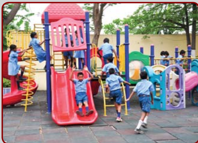
Visit for the Suryakiran students was organized to Rose Valley Park