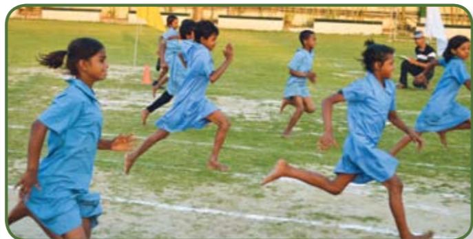
Suryakiran Students performing in Annual Sports