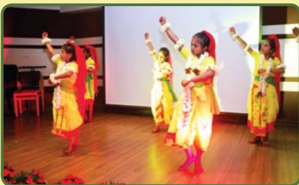
Performance by Suryakiran Students

The Heritage School adopted 33 schools in rural and tribal areas of West Bengal under One Teacher School (OTS) Project w.e.f. April 2013 for one year.