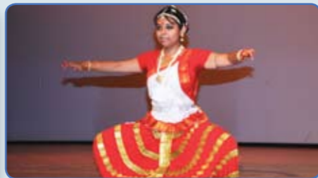
Students engaged in different activities during Elecia