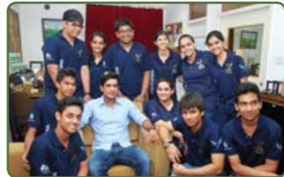
Eminent Cricketer Laxmi Ratan Shukla

Youthopia 2013 Annual Cultural Fest of THS was celebrated from 3 rd May to 5 th May 2013. During the fest Eminent Cricketer Laxmi Ratan Shukla and Tabla Maestro Bikram Ghosh were felicitated. There were 14 participant schools & 37 innovative activities.