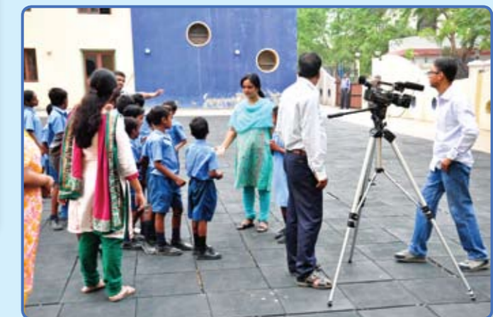
Students during the Shooting

Suryakiran students were highlighted in a documentary film on Health and Hygiene arranged by Vigyan Prasara, a unit of Department of Health and Hygiene, Govt. of India