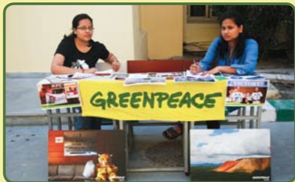
CSR activity during the Fest