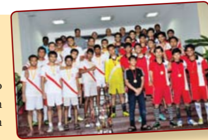
Elastico 2013 Inter College Football Tournament won by HIT-K

Well-known football player Jose R. Bareto visited HIT-K during the prize distribution and inauguration of Annual Sports Meet on 22 nd Feb 2013