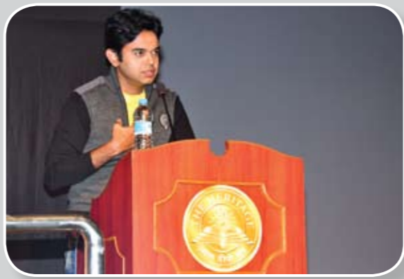
Cancer Awareness Programme was also organized at The Heritage School (THS) which was addressed by eminent actor Bobby Chakrabarty, on 5 th Feb 2013.