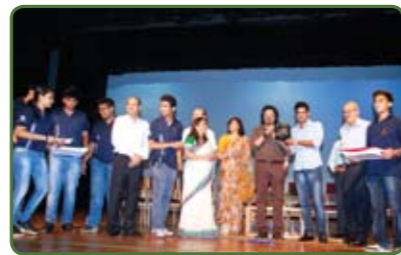
Eminent Tabla Maestro Bikram Ghosh (Fourth from the Right)