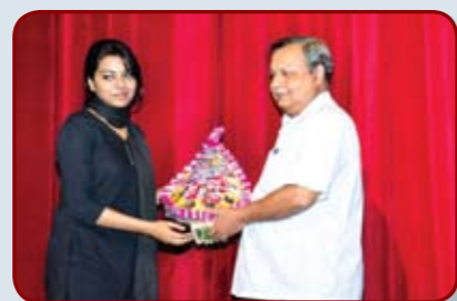
Photographer Asis Sanyal, Film Festival HIT-K