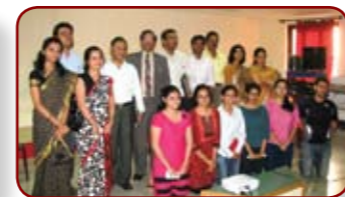
National Science Day at HIT-K by BT dept