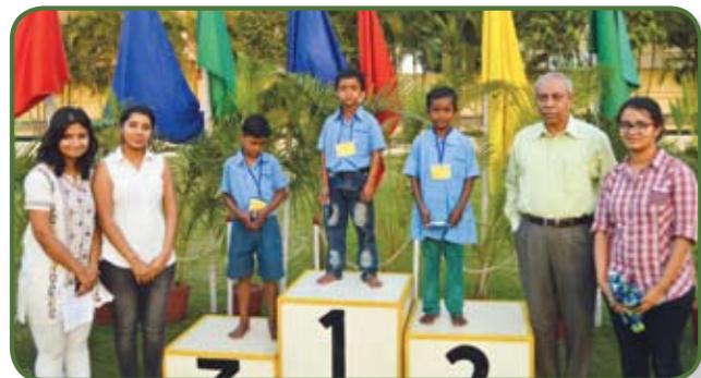
Rotaract Club members of HIT-K felicitating the winners