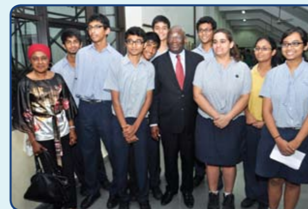
Professor Ibrahim Agboola Gambari (fourth from right)