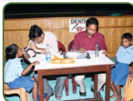
Medical camp organized for the students of Suryakiran