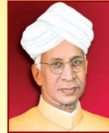
Dr. Sarvapalli Radhakrishnan, the Hon'ble 2 nd President of India, in whose memory Teachers' Day is celebrated every year on 5 th September which is his birthday.