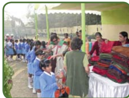
Distribution of Blankets to the children of Suryakiran School