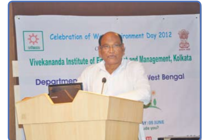
West Bengal State Forest Minister Shri Hiten Barman at the Heritage campus on World Environment Day (5 th June 2012).