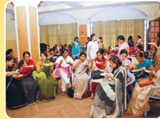
Teachers having lunch