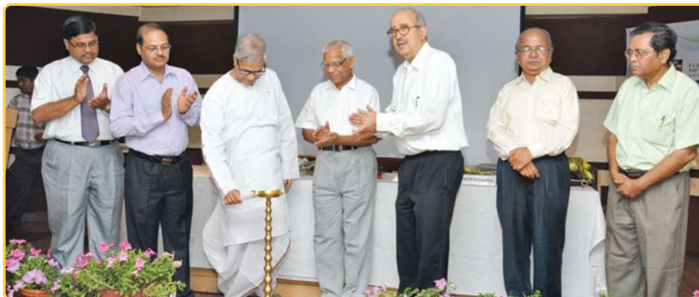
The Minister of Science and Technology, Govt. of West Bengal, Shri Rabiranjn Chattopadhyay, visited HIT on 15 th March 2012 and inaugurated the National Conference on Re-inventing Patrick White, which was organized by the Department of Humanities, HIT.