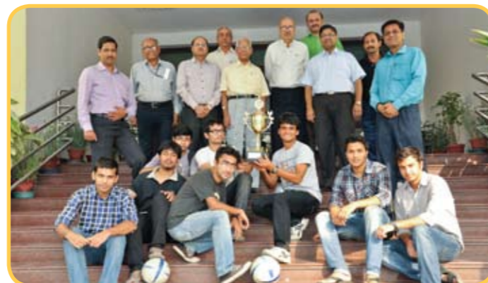
Heritage Institute of Technology won the Inter College Football Tournament organised by the Pailan Group in March 2012