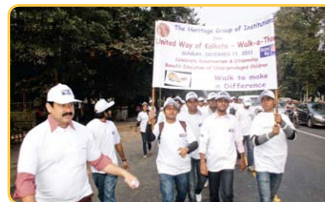
The Heritage students participated in The United Way Walk-a-Thon and The KMC Great Sarobar Run for a social cause in December 2011 and January 2012 respectively