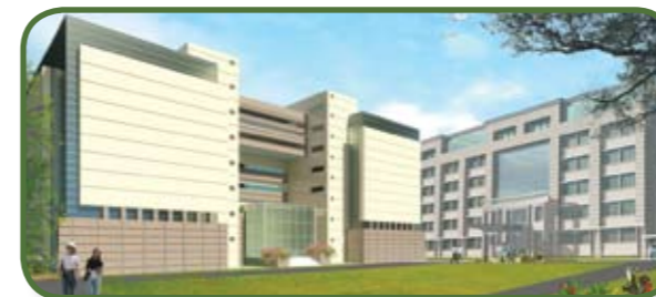
Artist's impression of the Central Block