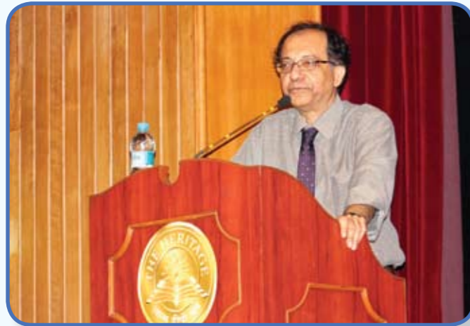
Prof. Kaushik Basu, Economic Adviser, Govt. of India, visited HITK on 4 th November 2011 for an interactive session on 'Indian Economy – the road towards globalization'.