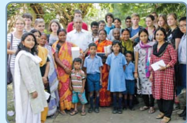
The Heritage School students donated Solar Cookers and Solar Lanterns to the parents of Suryakiran students in April 2012