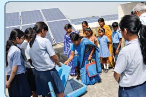
Solar power being generated at the Heritage Campus