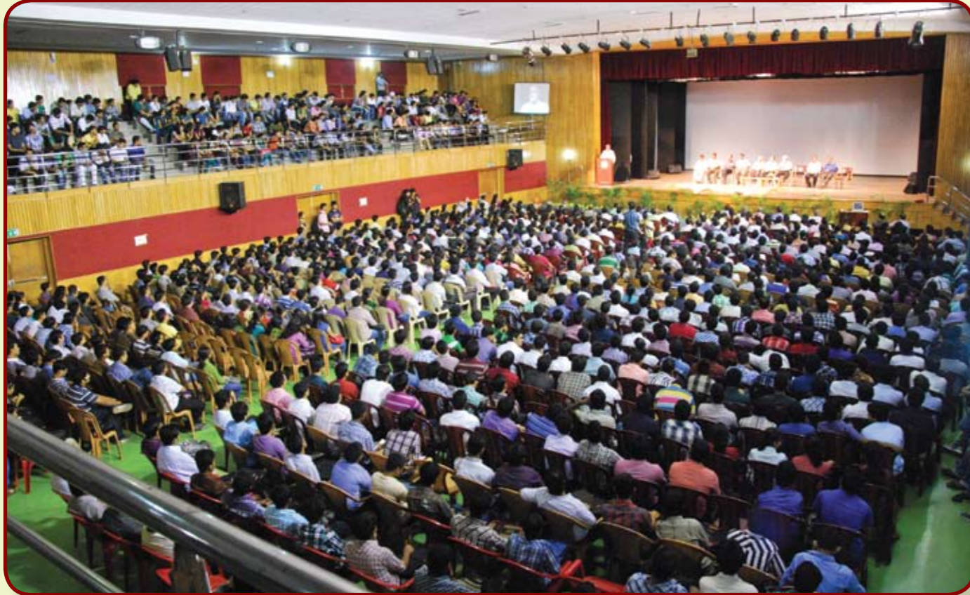
The audience at the Campus Orientation Meeting for Professional, Academic and Social Success (COMPASS) 2012 (induction and orientation programme for the new B.Tech students).