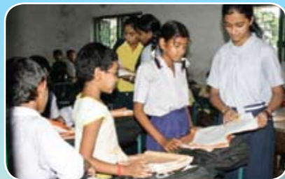
Students of class VIII of The Heritage School teaching students of class III in KMCP School.

The students of The Heritage School were directly involved with Daspara Kalikapur KMCP school under the Kolkata Learning Project. However, the learning availed of, will not be a one sided affair. Those who are socially well established will also learn from the underprivileged children whom they have assisted, skills that are applicable in daily life. Thus expertise is shared between children of different social levels, in an atmosphere conducive to fun-learning, with the purpose of multifaceted, collaborative education.