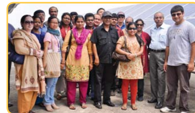
AZEECON Members cherishing The Solar Panels set up at the Heritage Campus