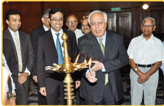
Shri Kapil Sibal at ICC Higher Education Conclave held in April 2012 which was co-sponsored by Heritage Group of Institutions.