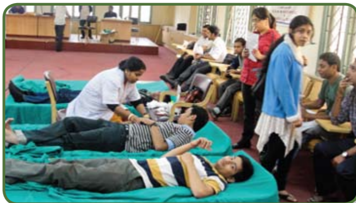
Blood Donation Camp organized by the HIT students for Kalyani, a charitable medical centre run by Kalyan Bharti Trust