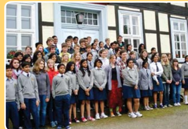
Visit of The Heritage School students to Sophie Scholl Gesamtschule (SSGS) Wennigsen, Germany in May 2012