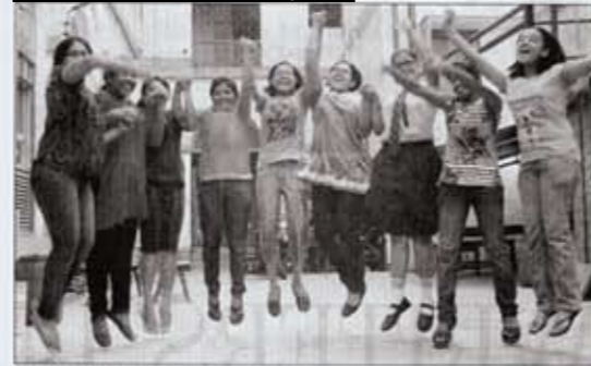
Calcutta Girls' High School students celebrate their success on Saturday.