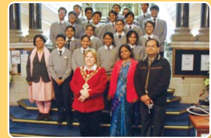
Visit of The Heritage School students to Whitecross Hereford High School and Specialist Sports College, Herefordshire, United Kingdom in October 2011