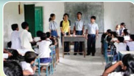
Students of The Heritage School at Daspara Kalikapur KMCP School